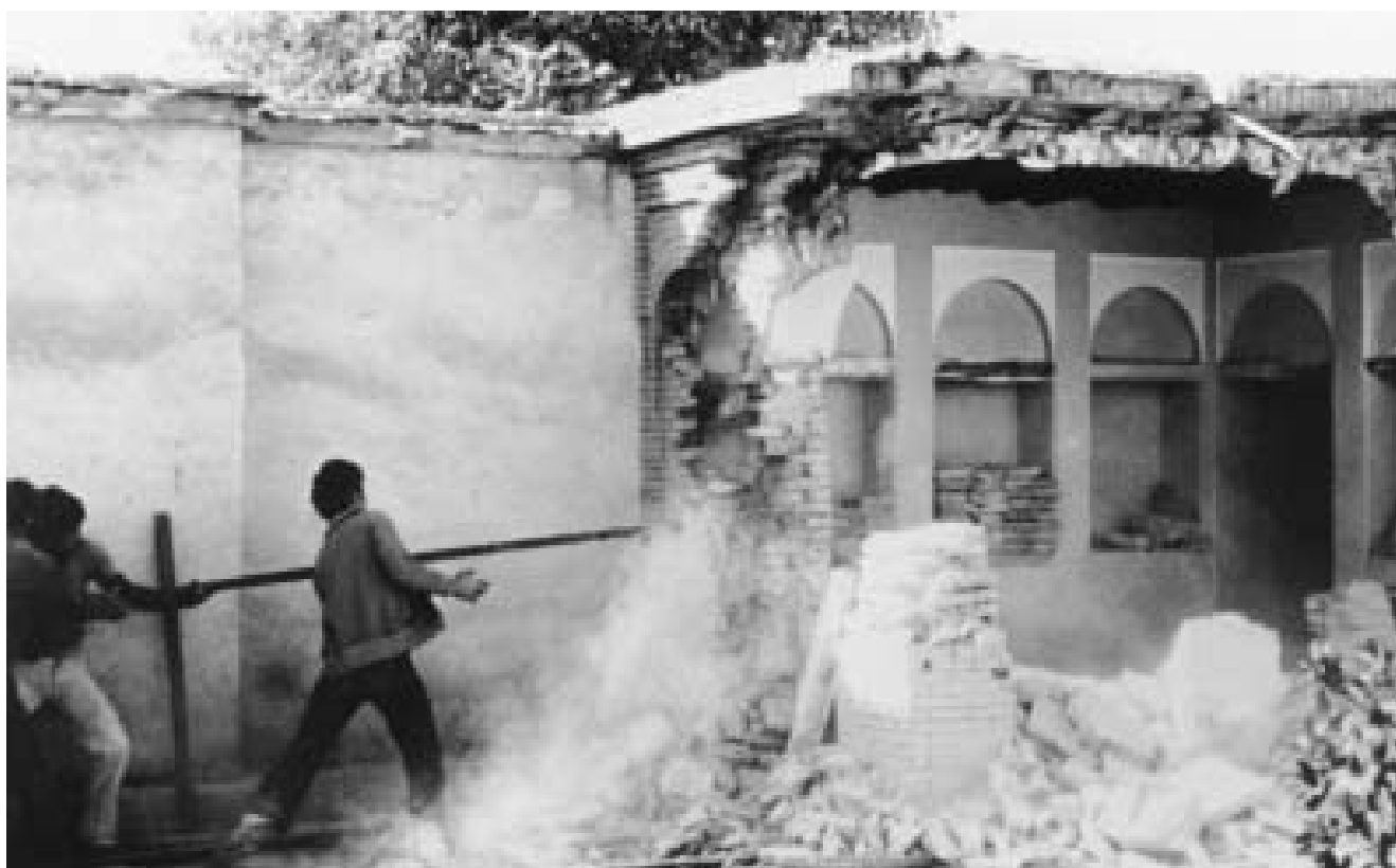
The House of the Bab in Shiraz, Iran, where He declared His mission as a Messenger of God, was destroyed 30 years ago this year – in 1979 – by a mob.