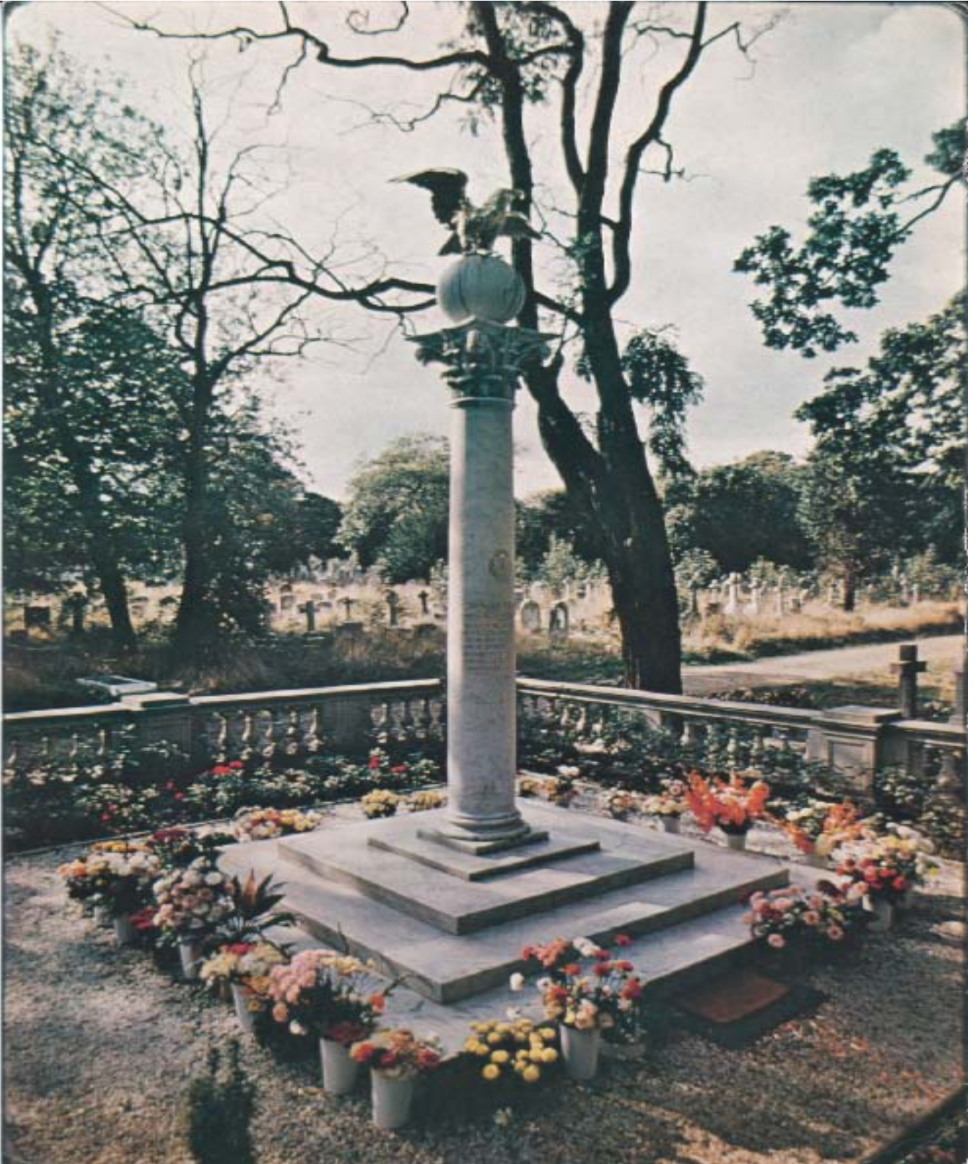
RESTING PLACE OF SHOGHI EFFENDI THE 1 ST GUARDIAN OF THE BAHÁ'Í FAITH