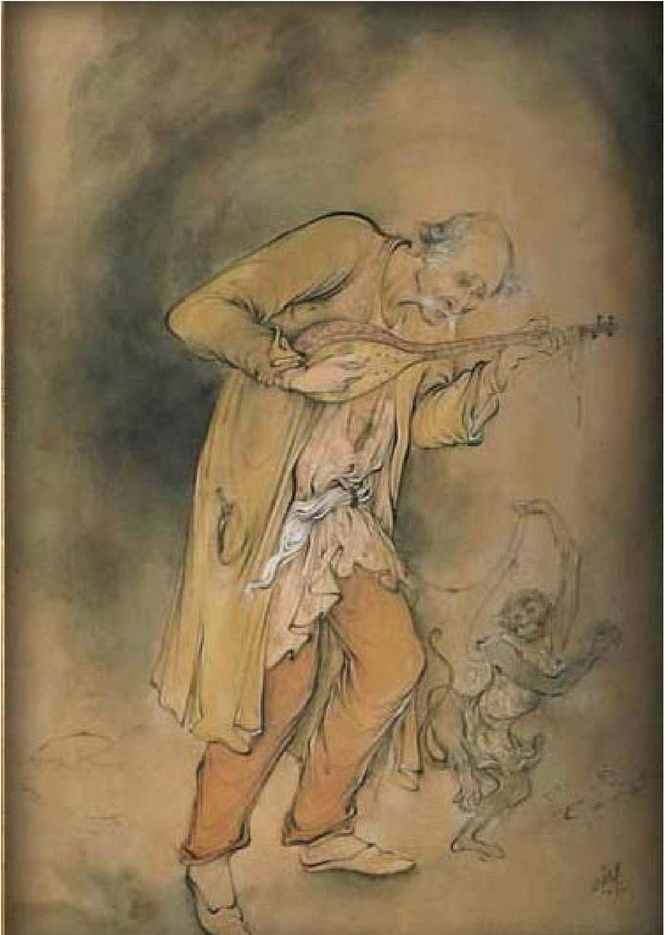
Sorrow and Joy A PERSIAN CLASSICAL MINIATURE PAINTING