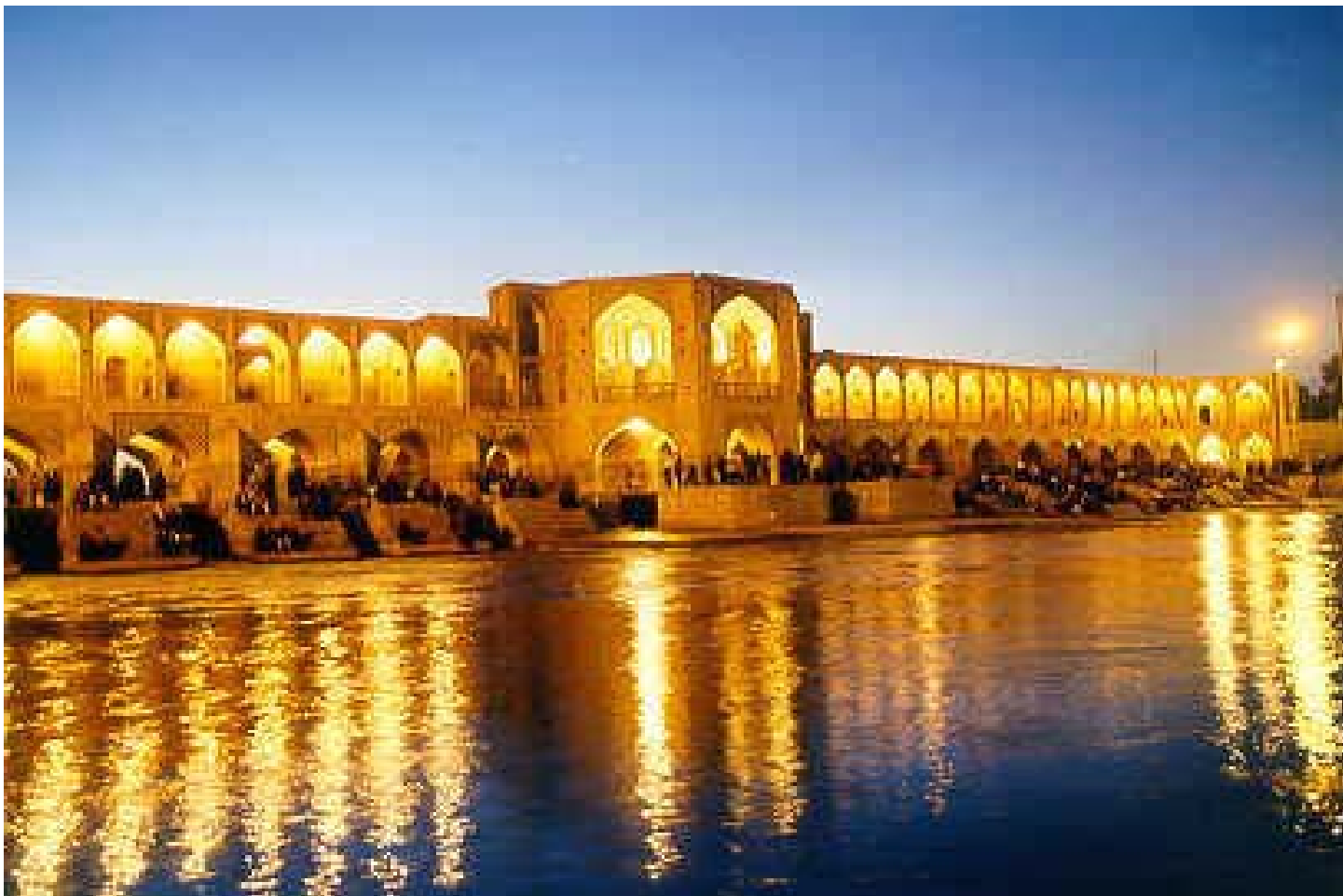
The Khaju bridge, the best known bridge in Esfahan

appointed me President of the Baha'i International Council, giving me the responsibility of its President ship and explained to the Baha'i world that he was thus taking the first step toward instituting the embryonic Universal House of Justice, he placed in my hands a responsibility that I am undertaking to carry, and a responsibility in which I need the cooperation and the help and the devotion of the Hands of the Faith and of the entire body of believers the world around; therefore, I am first explaining and telling you that I am your Guardian, and that I wish you to announce this to the believers in all parts of the world.