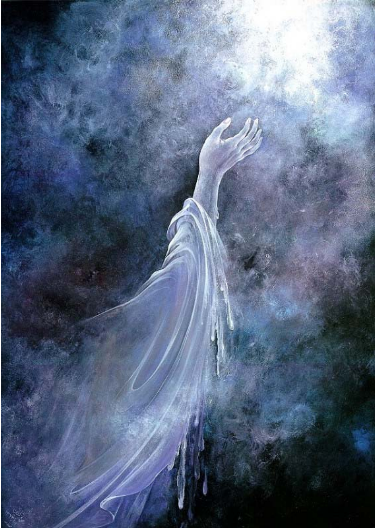
O God By M. Farshchian